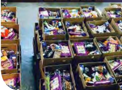
MARSHFIELD ST. VINCENT DE PAUL collected and organized food for distribution to the needy.

Ensured customers were connected to work, school, family and friends by giving extra high-speed data and internet service valued at over