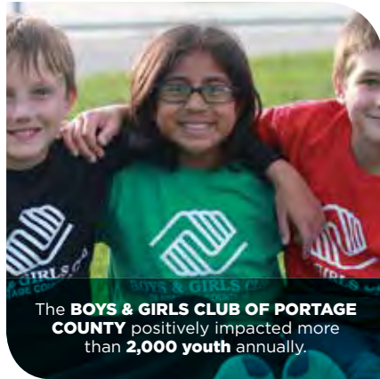
The BOYS & GIRLS CLUB OF PORTAGE COUNTY positively impacted more than 2,000 youth annually.

furthered the efforts of local nonprofits and community organizations