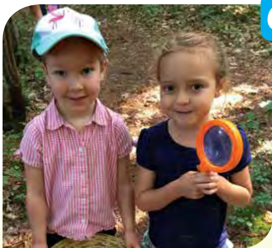
NORTH LAKELAND DISCOVERY CENTER MANITOWISH WATERS