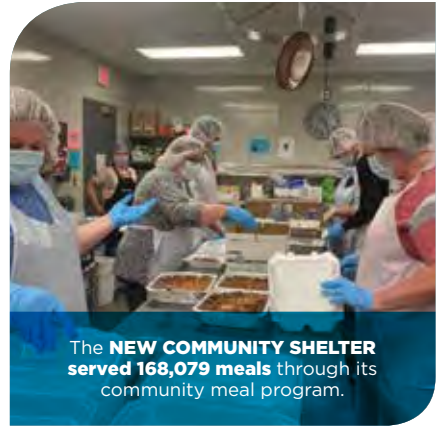
The NEW COMMUNITY SHELTER served 168,079 meals through its community meal program.